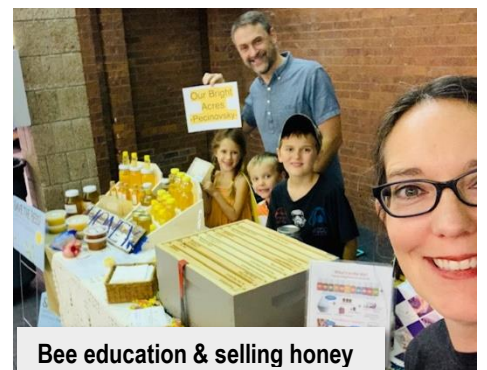
Bee education & selling honey

May the Spirit of Christ dwell with you richly this season!