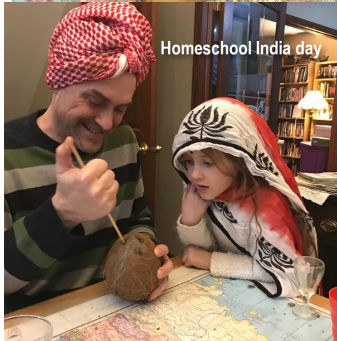
Homeschool India day